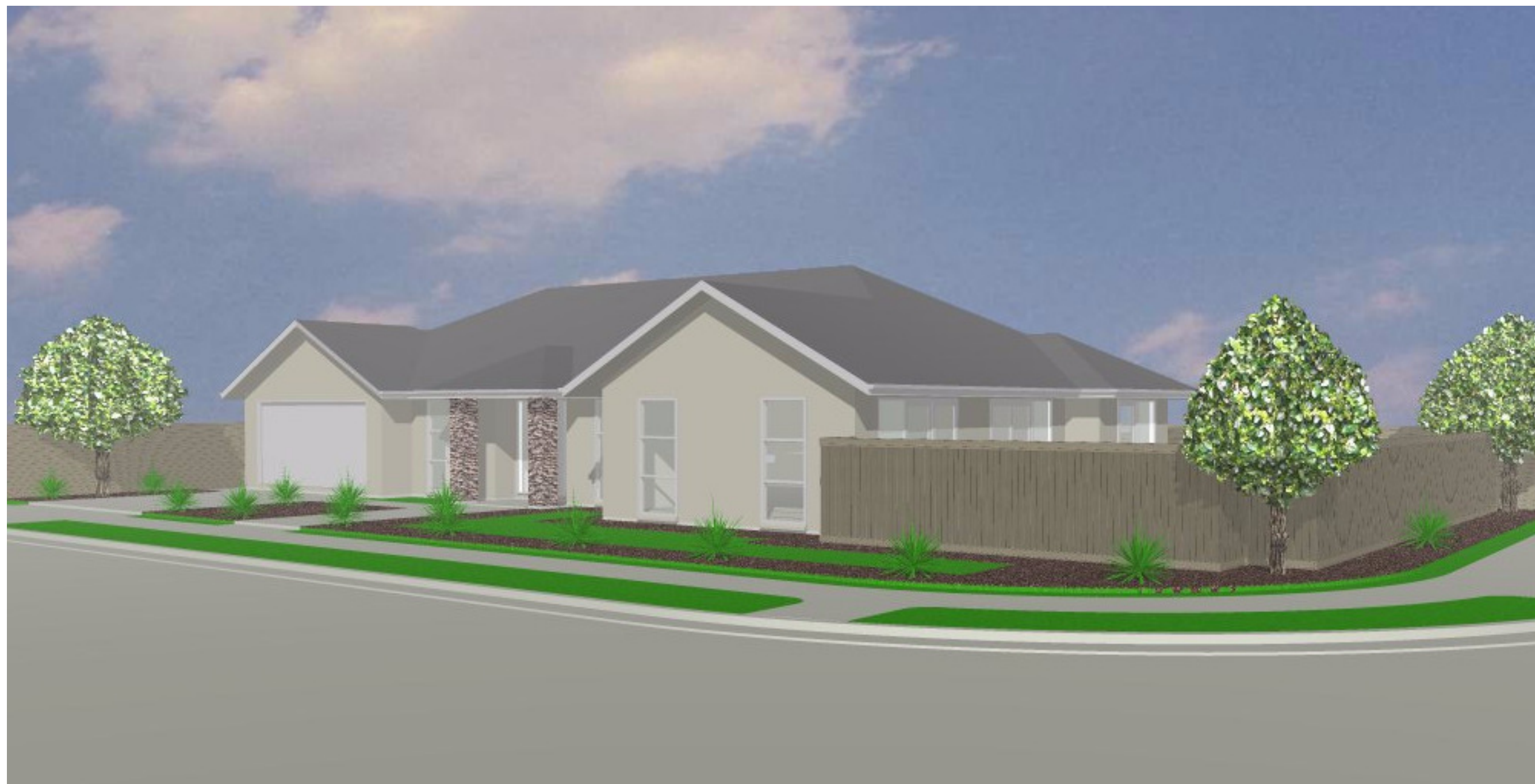
Front Perspective View

PROPOSED NEW RESIDENCE LOT 355 BAMBER CRESCENT - HALSWELL