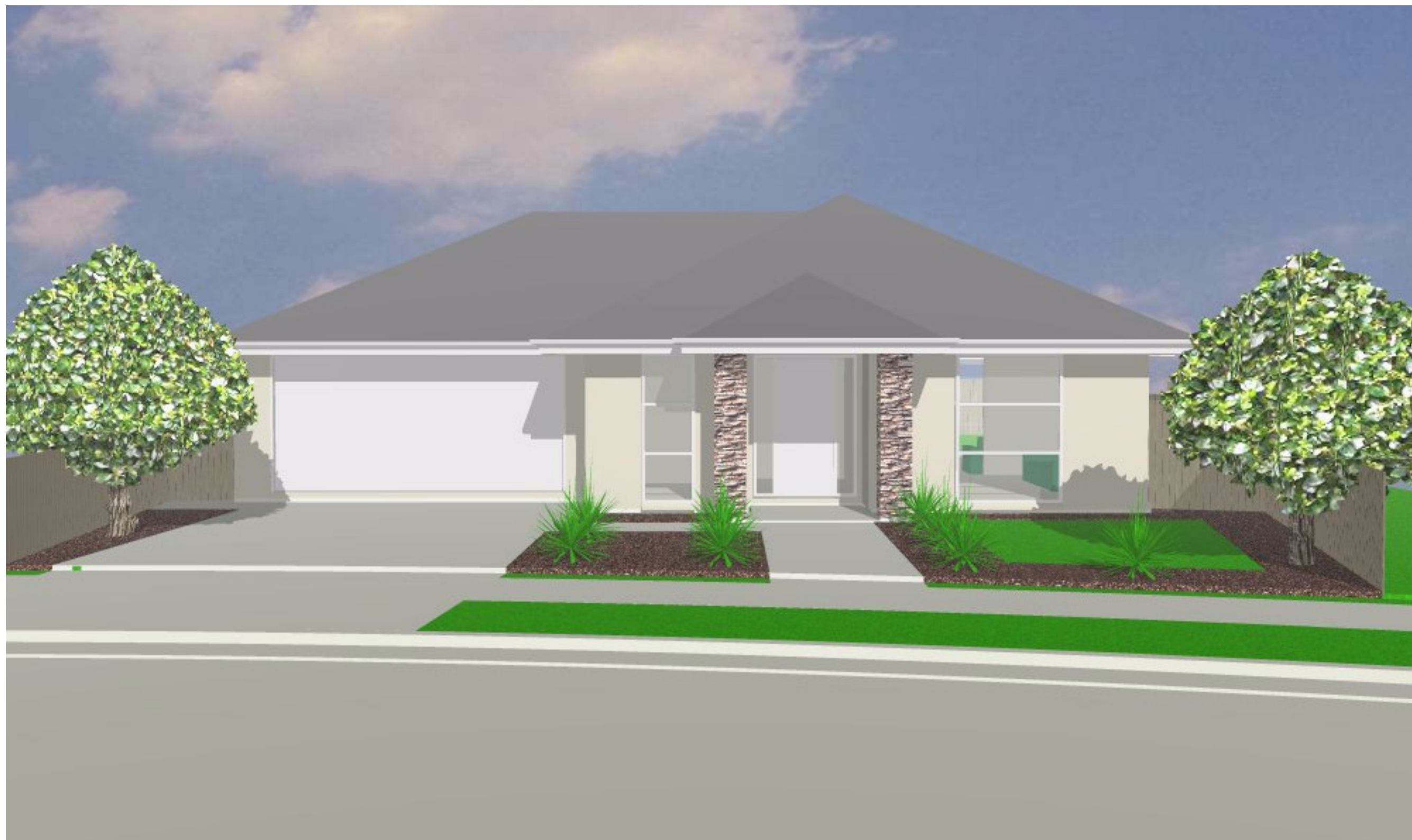
Front Perspective View

PROPOSED NEW RESIDENCE LOT 302 PIPER STREET - HALSWELL